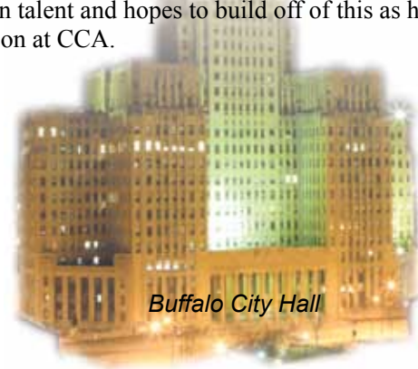
Buffalo City Hall