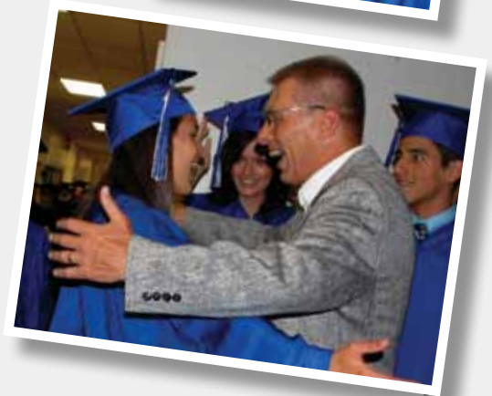
Graduation Day, June 25, 2011