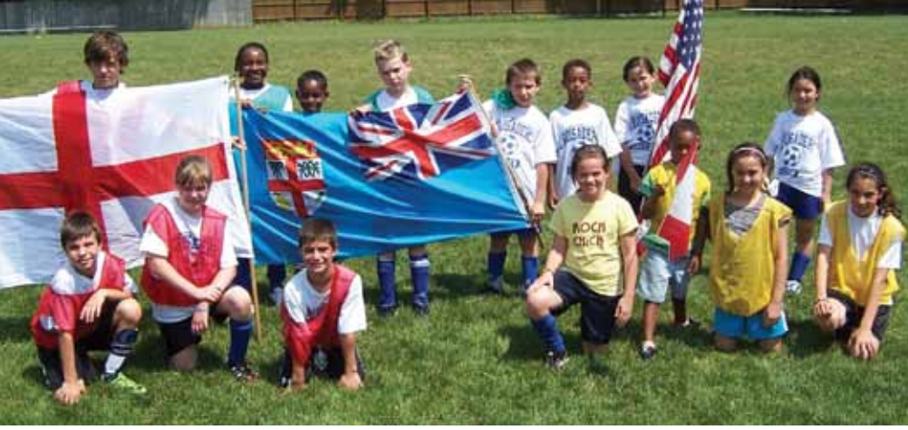
World Cup Jamboree held on Saturday, June 18 for Grades 3–4