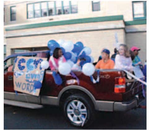
Homemade floats parade through Williamsville from campus, down Main Street to North Forest, then to Sheridan Drive, and back to the CCA campus.