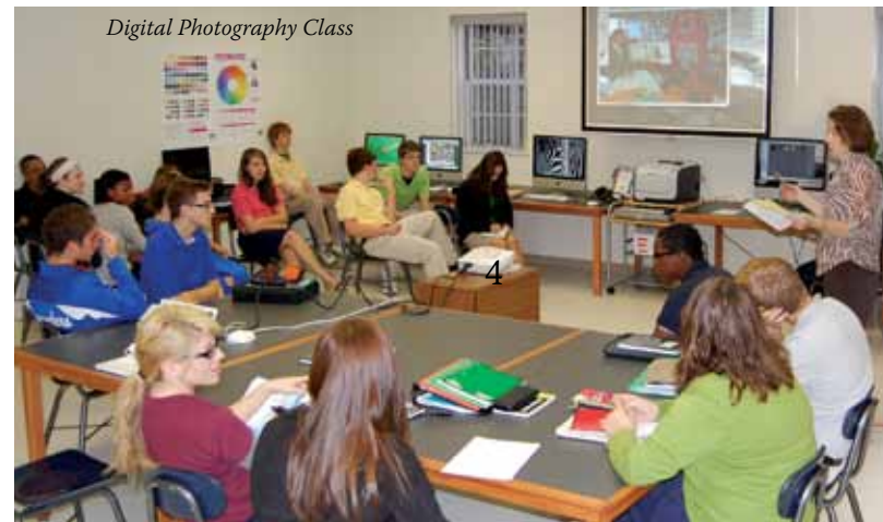
Digital Photography Class