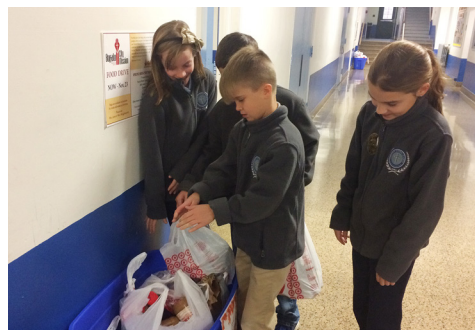
Fourth graders contributed with joyful hearts to the Buffalo City Mission Food Drive in November. Specific needs included frozen turkeys, non-perishable food items, and toothbrushes.