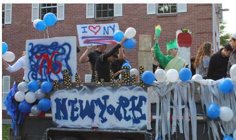
The winner of the Homecoming Parade Float contest was the Senior Class with their New York themed float. 2 Corinthians 7:16 was the inspiration.