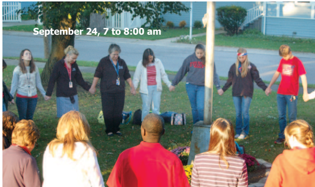
September 24, 7 to 8:00 am

Each September students and teachers have the opportunity to meet before the start of school at the flag pole to pray for God's direction during the coming school year. This "See You at the Pole" nationwide event began in Texas in 1990.