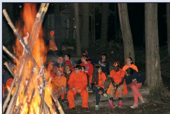
At the annual H.S. retreat during September 18-19, students had an opportunity to share a testimony about their relationship with others and God. Thursday closed with a bonfire; sitting in the foreground are mainly freshmen dressed in their red class color.