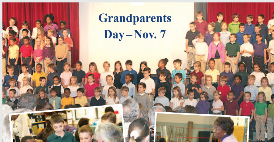
Grandparents Day – Nov. 7