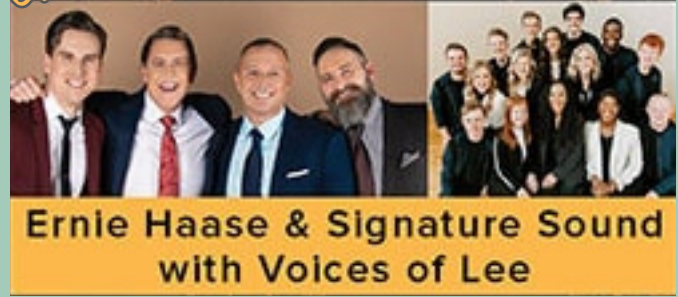
Ernie Haase & Signature Sound with Voices of Lee

Video about the One Night Only tour! Four cities. Free Tickets.