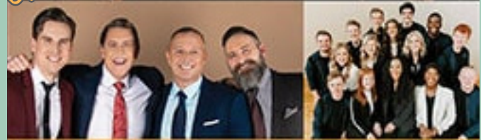
Ernie Haase & Signature Sound with Voices of Lee

Video about the One Night Only tour! Four cities. Free Tickets.