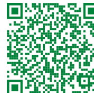
The House of Lewis

Together we can bless these families and share the Christmas story to kids through kids!