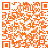
The House of Bonhoeffer