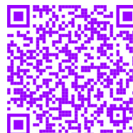
The House of Edwards